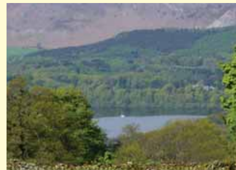
Views from the site